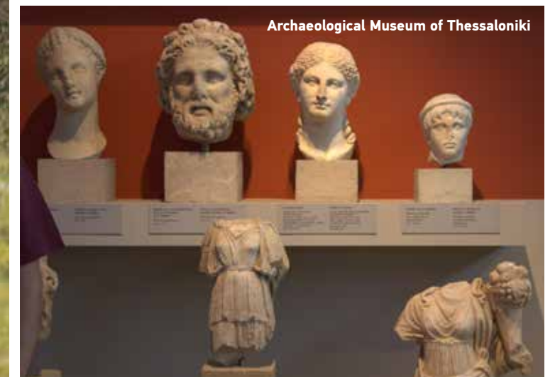
Archaeological Museum of Thessaloniki