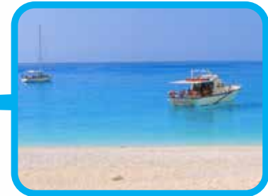
Chalkidiki a 40 min drive to some of the best beaches in Greece