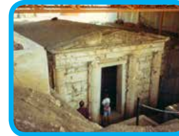
Royal Tombs of Macedon an hour's drive from meeting the Greek gods