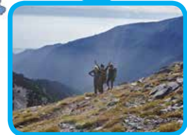
Mt. Olympus an hour's drive from meeting the Greek gods