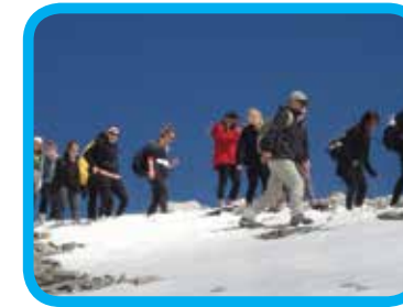
Seli an hour's drive to the closest ski resort

We help acquaint, and reacquaint, students with the Hellenic culture, language, history, and hospitality.